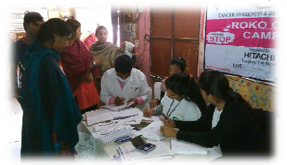
Hence we have been organizing continuous camp in cooperation

Cancer Detection Camp: To detect cancer at early stage, subsequent treatment is necessary.