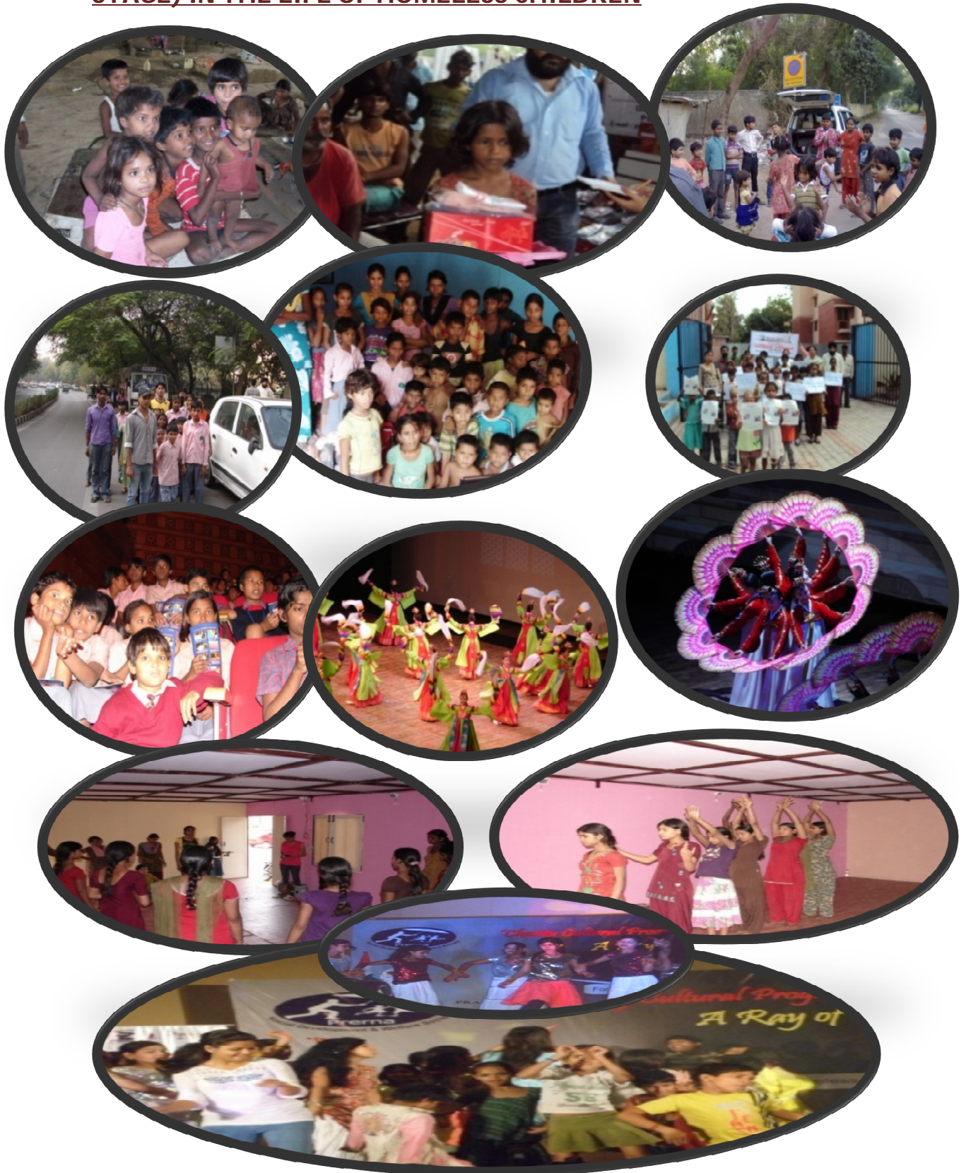
PHOTO STORY OF CHANGES (STREET TO SCHOOL AND THEN AT BIG STAGE) IN THE LIFE OF HOMELESS CHILDREN