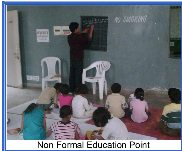
Non Formal Education Point

During the financial year 2010-2011 PRERNA provided non-formal education to more than 300 children through the centers in seven contact points. Out of this 60% of them were girls. We were running non-formal centers at South Delhi where there were more than 5000 children present and only one Government school in that area. Prerna is focusing especially on ' girl child education ' for making them as a successful home maker of the future.